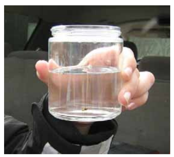
Macroinvertebrates are preserved in alcohol for later identification.