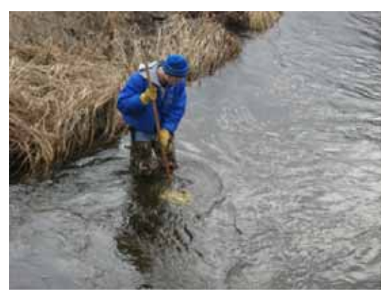
Grygla student uses a kick net to collect macroinvertebrate samples.

River Watch volunteers collect macroinvertebrate samples for water quality assessment.